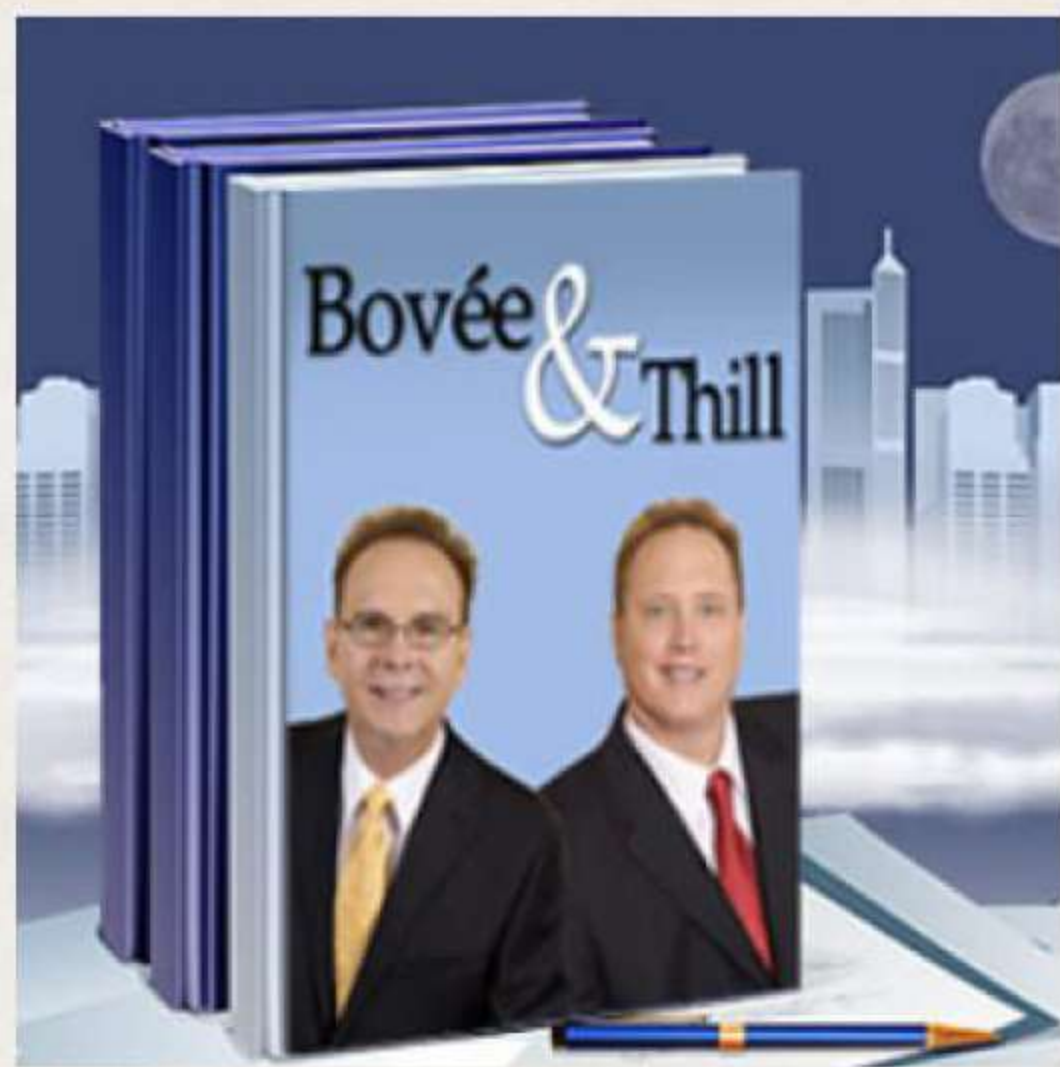
Bovée & Thill's Business Communication Blog gives instructors unique insights about the field.