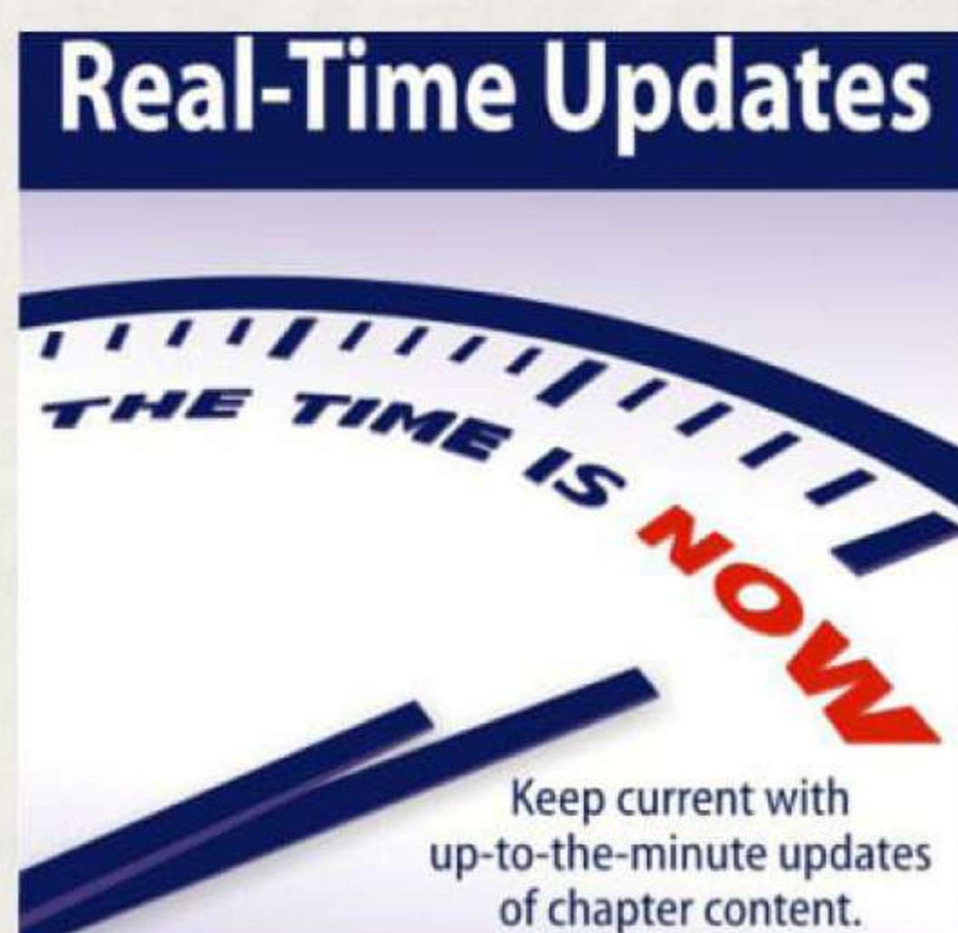
Real-Time Updates keep Bovée and Thill textbooks current for instructors and students.

To order an examination copy of a Bovée and Thill text, visit the ordering page